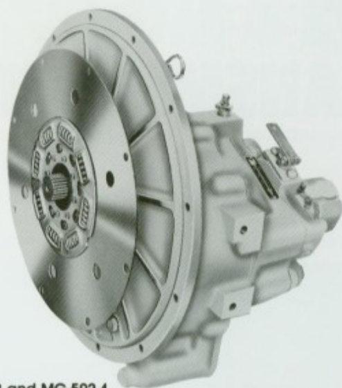
MG-502 and MG-502-1

(Shown with optional housing flange and torsional drive plate)